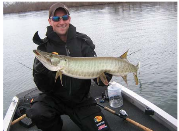
Nick's Group has (12) fish day on Spring Lake (7) fish over 30"