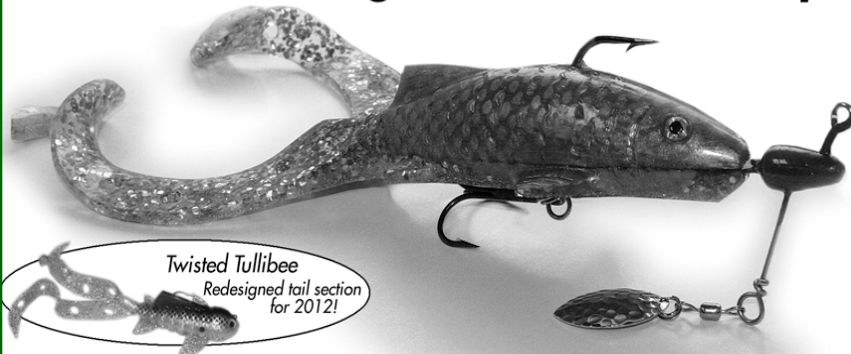
Twisted Tullibee Redesigned tail section for 2012!