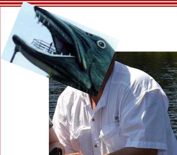
DVD talks Muskie - Live at FRV in Dec!!