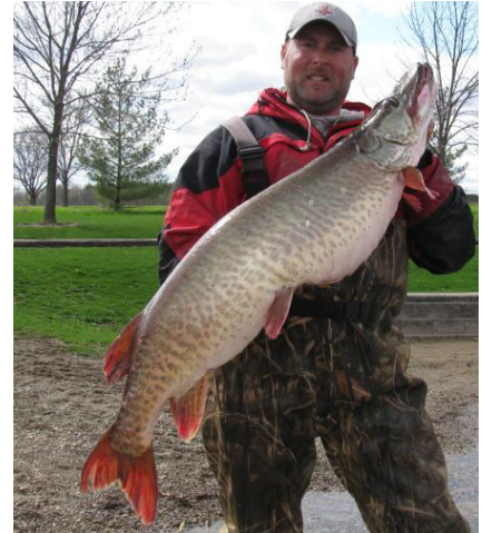
IMA Barrier Rescue – 40 Pound Musky Returned to Lake Evergreen in Bloomington, IL