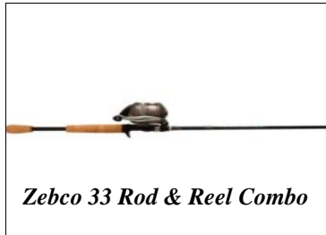
Zebco 33 Rod & Reel Combo

Fox River Valley Chapter 39 Muskies, Inc. partnered with Cabela's and bought 100 new Cabela's Rod and Reel Combos for the Illinois DNR sponsored Chicago Urban Fishing Program, which teaches kids about fishing and the great outdoors.